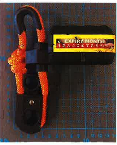
HRU opposite side