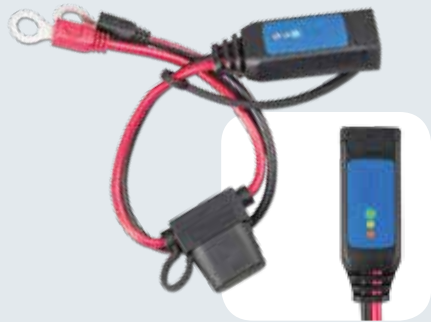
Battery indicator eyelet M8