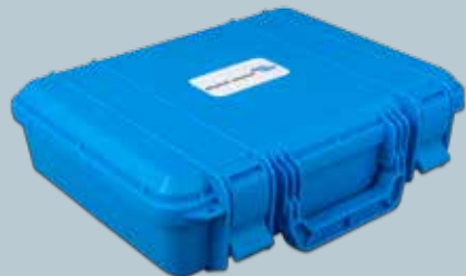
Carry Case for Blue Smart IP65 Chargers and accessories