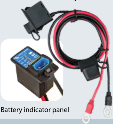
Battery indicator panel