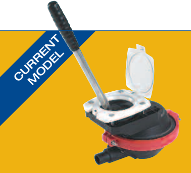
Pictured with Deckplate AS0356